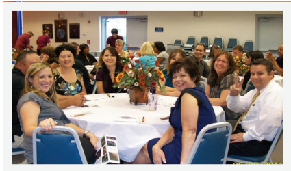
Gila Valley Leadership Class VI